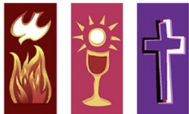
Confirmation Eucharist Reconciliation

Our next Sacramental Program will be announced in May, commencing with Confirmation, students in year 3 and above.